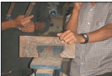
Students learning welding at Don Bosco Training College

The Mary MacKillop Institute supports East Timorese people to pursue further education and training, mainly in East Timor itself. The Buka Matenek Program assists University and trade school students with fees and living expenses.