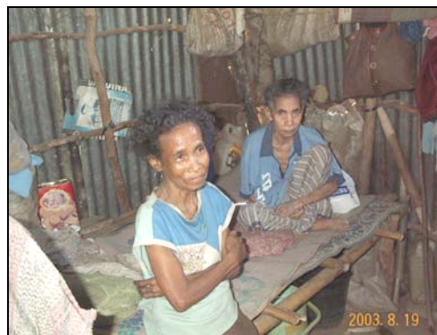
Old people needing assistance