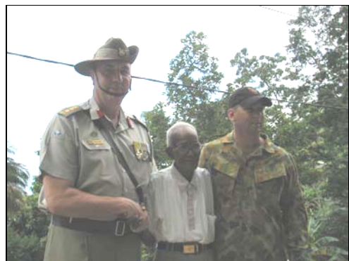
Dawn Service, Dili, April 25, 2003

We are attempting to get his story written, so that it can be told and retold, not only in East Timor, but to the young people of Australia.