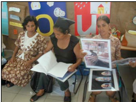
Teachers at literacy workshops

The Tetun Literacy Programme is the main work of the Mary MacKillop Institute. In the ten years we have produced a complete literacy program for Grades K-4, with teachers' manuals, support documents, dictionaries and resources.