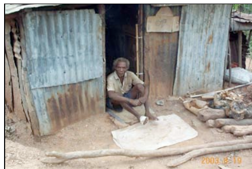
One of our friends outside his house

The Mary MacKillop Institute encourages and supports community health initiatives. It helps to design, develop, publish, distribute and help implement Tetun Community Health books and resources for the basic instruction and information of the East Timorese people and their communities.