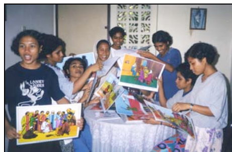
Religious resources in great demand

The Institute works with the Diocese of Dili to provide religious education resources for parishes and catechists.