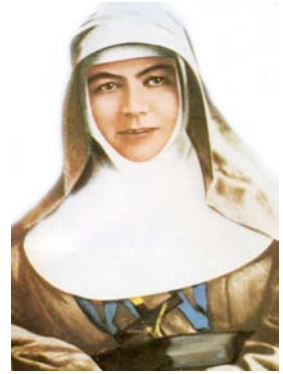
Santa Mary da Cruz MacKillop, harohan mai ami.

Consolidation of our teacher workshops is underway, aiming to enhance further the skills of our staff so that they in turn can help teachers to develop theirs.