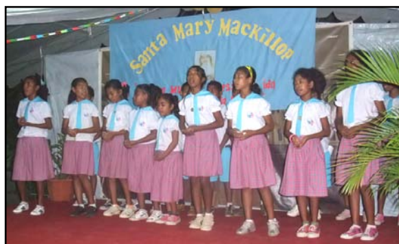
Ermera children singing their Mary MacKillop song