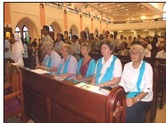
Some of the Sisters present at the Mass