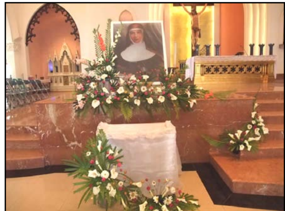
Display in Cathedral sanctuary

The MMETM staff excelled themselves in the organisation of all facets of this memorable event.