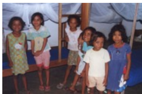
Children cared for at the orphanage

We continued the Maubara Project where through the Orphanage quality care as well as opportunities for education are provided for children. We also gave books and educational resources to the local kindergarten which caters for children from the orphanage and the local community.