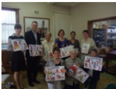
Staff with Charts funded by Janssen-Cilag