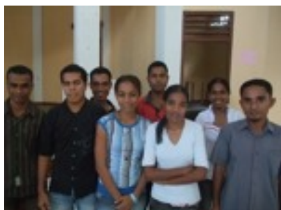
Group of MMETM students at monthly meeting

The Don Bosco Trade school at Fatumaca received assistance to enable a vehicle to be repaired and we gave the Don Bosco school at Comoro help for the education of students. We also facilitated the handing over of financial support for student fees from the Andrew McNaughtan Foundation to Fatumaca and donations from Gosford Rotary for tools for both these Don Bosco schools.