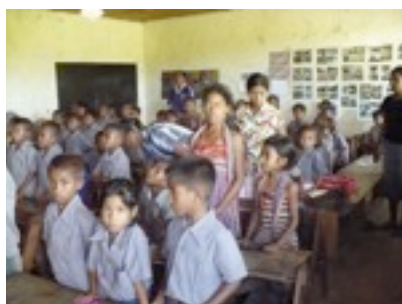
School children welcoming visitors

A unique wartime history links the nations of Australia and Timor-Leste and the affinity that exists between our two peoples is expressed by many individuals and groups assisting Timorese development. However, successive Australian Governments have continued to exploit some resources of the Timor Sea which East Timor claims, and there is no official Australian support for the establishment of an International War Crimes Tribunal.