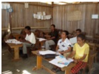
Teachers at Epelo

This program of financial support for teachers was delivered in association with regular teacher in-service training, ensuring that the MMETM staff supported and monitored these teachers' progress and skill-building.