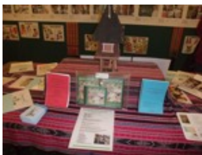
Health and nutrition display, Baulkham Hills