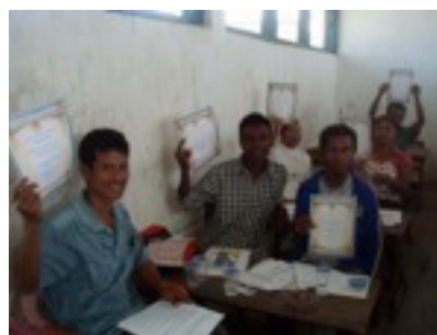
Teachers at Balibó with certificates