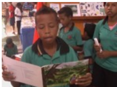
Boy reading at literacy display

MMETM continued to produce the Kindergarten books generated previously and had them transported to Timor-Leste. Forty-four titles in the Kindergarten series totaling 9,782 books were produced by hand at St Marys and shipped to Timor, and 500 copies of 4 titles in Big Book format were professionally printed and sent.