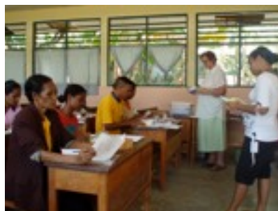
Teachers at Maloa

The low level of teachers' wages reflects both the lack of quality teaching and the general low opinion held in Timor-Leste of the importance of the work of the teacher. We believe it is essential that our future planning gives primary importance to the vocation of teaching, and to raise the profile of the teaching profession by assisting with the development of observable excellence.