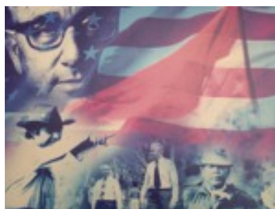
Display at CAVR Human Rights exhibition, Dili