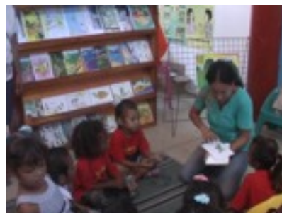
Teacher using MMETM books