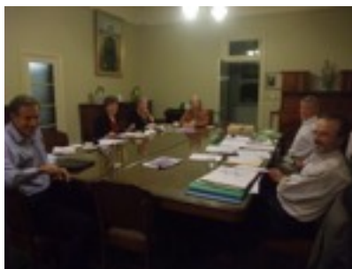
Building Committee, Sydney