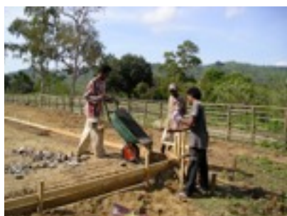
Working on the Oetapo building

After ten years and hundreds of thousands of dollars expended, we are pleased to have contributed to the reconstruction of Dili Diocese schools and to skills training in Timor-Leste, thus providing safe and useable school facilities to 20 communities. The programme's large training component over some years helped 15 men to become skilled and highly employable workers. Skills of local community workers were also used and enhanced during this time, as all buildings were constructed in consultation with the local community and using voluntary labour from that area.