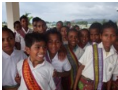
Children ready for Music School Concert