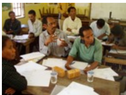
Workshop at Bessilau

Staff development is such that the MMETM Timorese staff undertook the responsibility for planning and delivering the workshops with growing competence and expertise, with the assistance of senior MMETM staff.