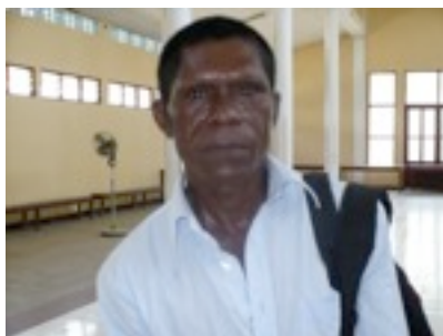
Teacher from Fatubesi