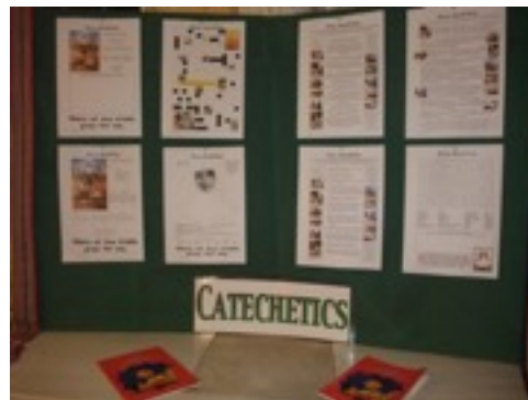
Catechetical materials on display

MMET provided some religious education resources suitable for both catechists and primary school teachers in the form of small booklets. Also, 2000 copies of the life of Mary MacKillop were sent after translation. No tax deductible donations are used for this project.