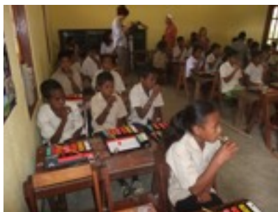
Percussion at Bessilau