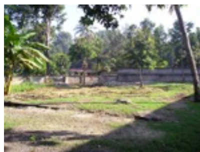
Becora site for MMETM Centre